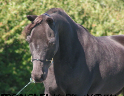
Photo by @Elvez on Instagram. "I'm 10 for the day before he was gelded." Photo by @Elvez on Instagram. "I'm 10 for the day before he was gelded."