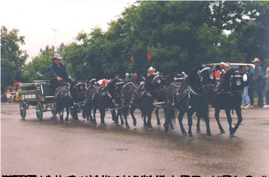
Photo by @Elvez on Instagram. "I'm 10 for the day before he was gelded." Photo by @Elvez on Instagram. "I'm 10 for the day before he was gelded."